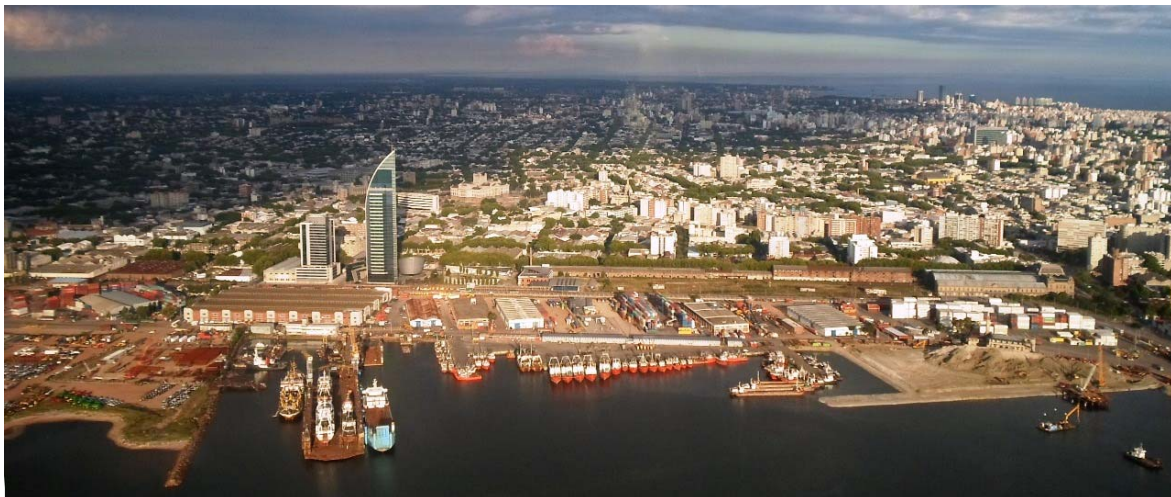
(Below) Flying over Montevideo’s port.