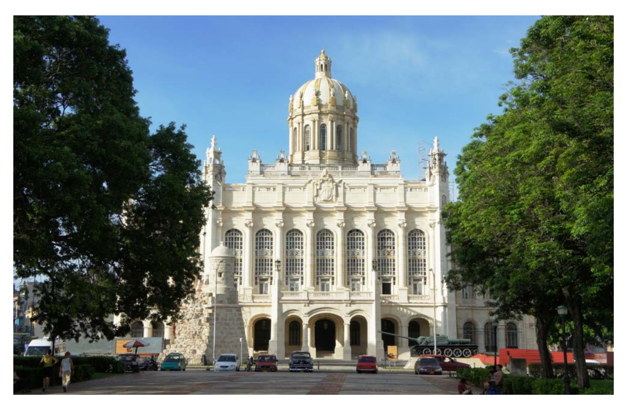
(above) The Museo de la Revolución is located in the Old Havana and was the former Presidential Palace of all Cuban presidents, including dictator Fulgencio Batista. After the revolution, it was turned into a museum and features a wide range of artifacts, including aircraft, rifles, uniforms, maps and other military gear.