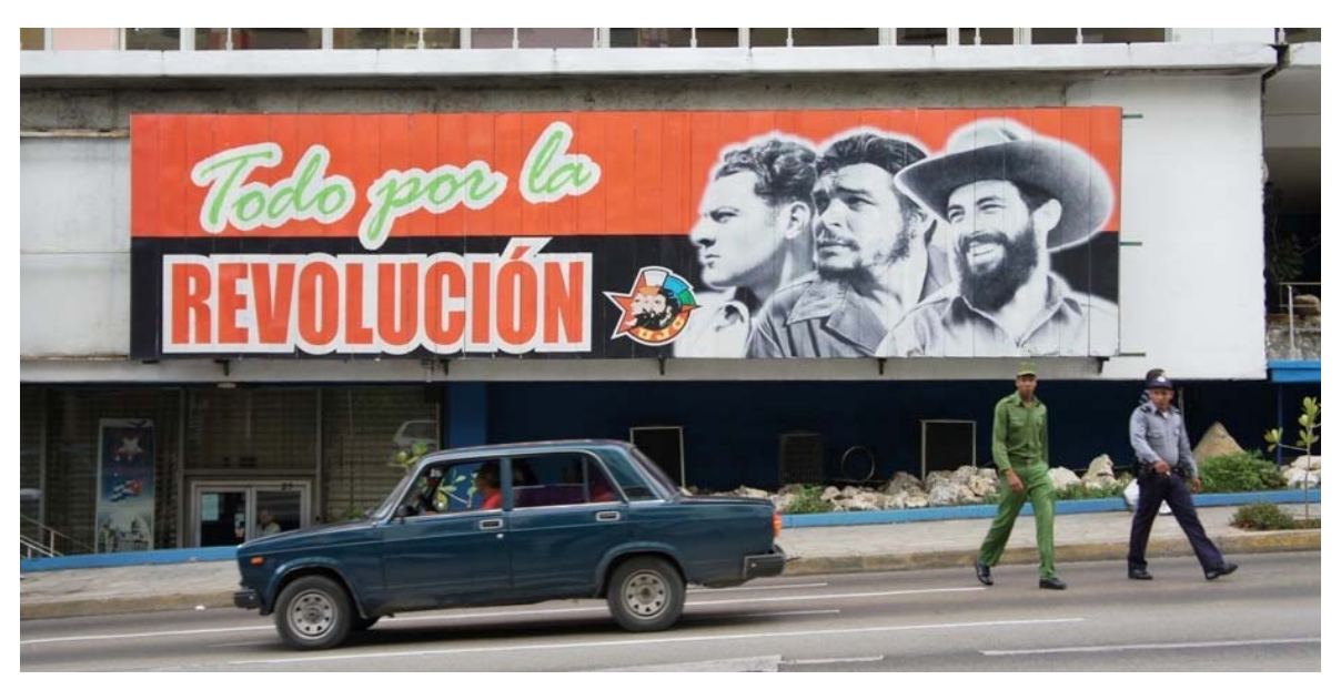
(above) Security forces pass by a revolutionary billboard along Avenida 23, in downtown Havana.

Travel restrictions for Americans have been loosened in recent years, but it is still not sufficient to allow most Americans to enter legally. Consequently, only a fraction of U.S. travelers--including A.C. Frieden--are able to visit the island with proper authorization from the U.S. State Department. However, Cuba enjoys over a million tourists annually from other nations, which provides the needed source of foreign currency. This foreign income has helped sustain the difficult economic conditions that resulted from the collapse of the Soviet Union in 1991 and the subsequent end to billions of dollars of subsidies. Fortunately for Raúl Castro's regime, Venezuelan leader Hugo Chavez has in recent years given substantial economic aid to the island nation, including oil at below-market prices. "Without Chavez's support, it's hard to imagine how Cuba could maintain its controlled economy and weather the global economic downturn," said Frieden.