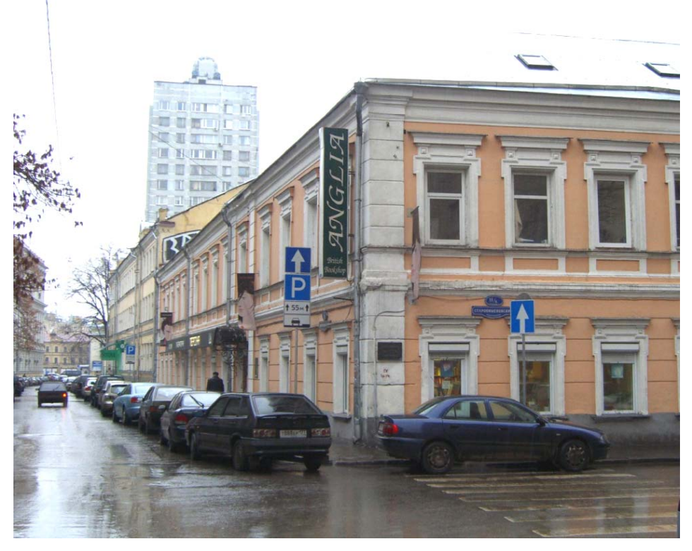
(above) Anglia British Bookshop in downtown Moscow.