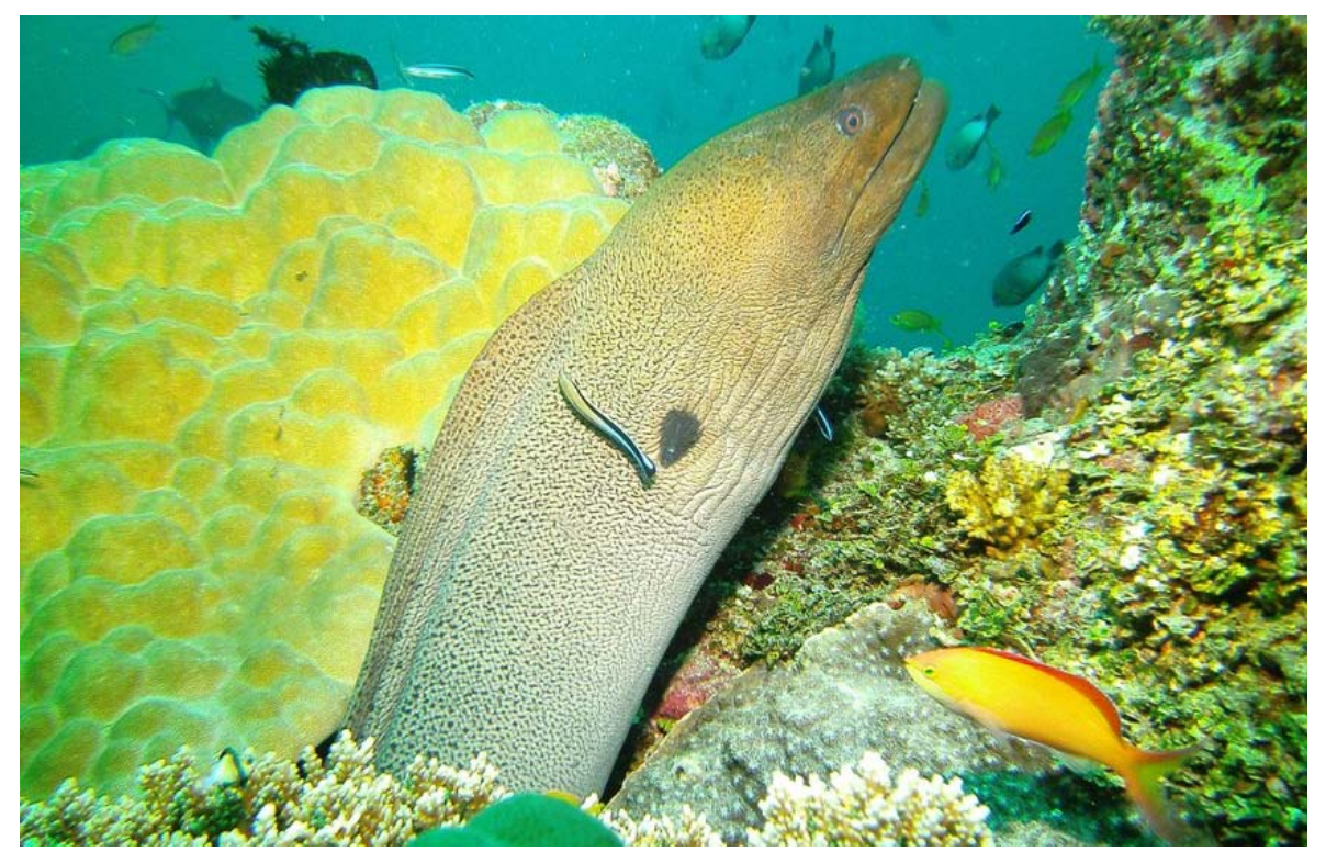
(Above) A large moray eel comes out of a crevice to look for prey.