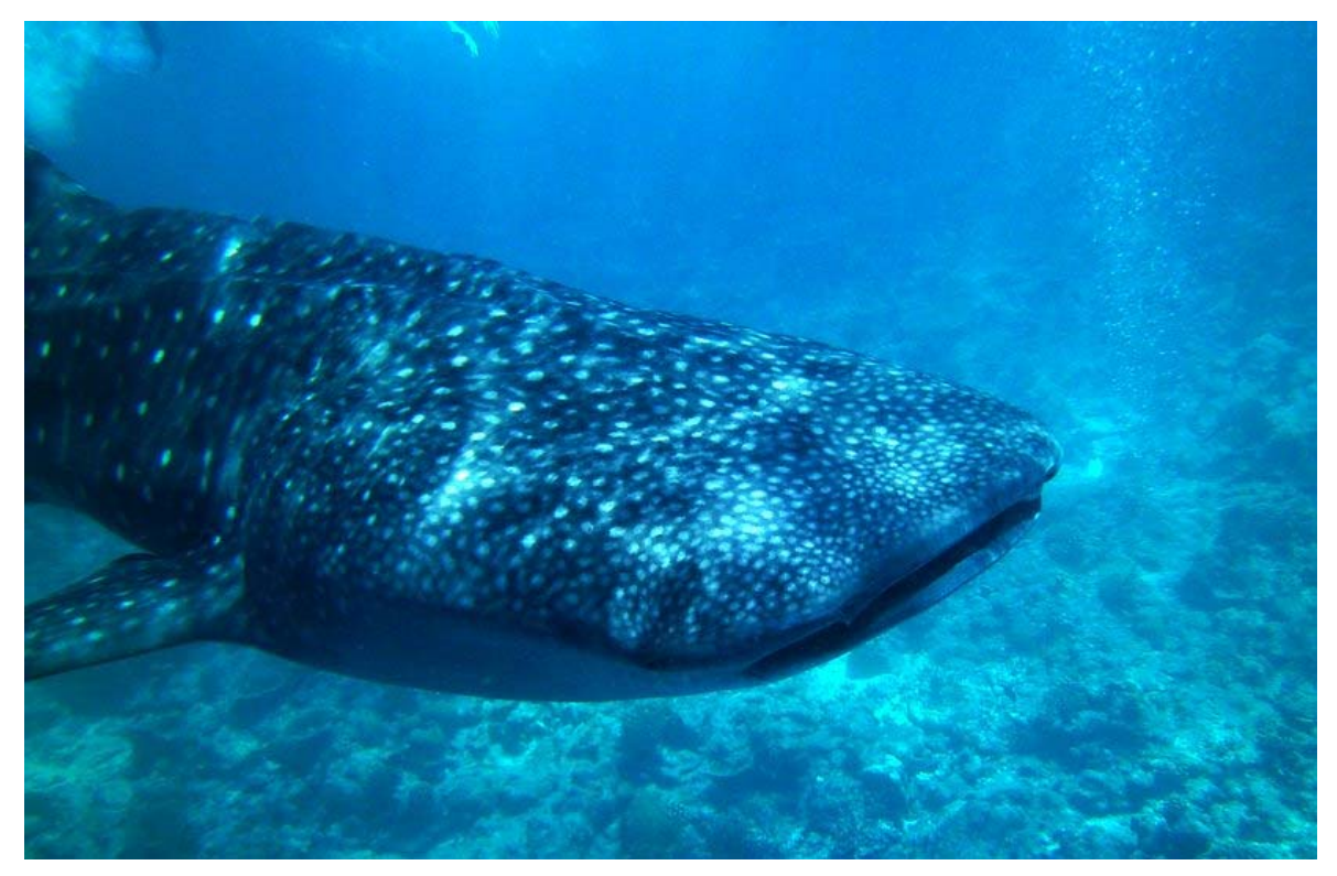
(Above) A.C. Frieden spotted this 20-foot whale shark passing by at a shallow depth.