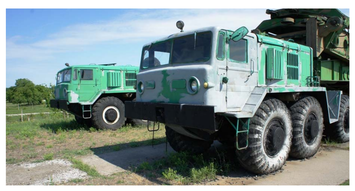
(Above) Heavy trucks that were used to transport missiles and support equipment. (Below) A path through two armored doors leading to a small elevator in the launch command bunker.