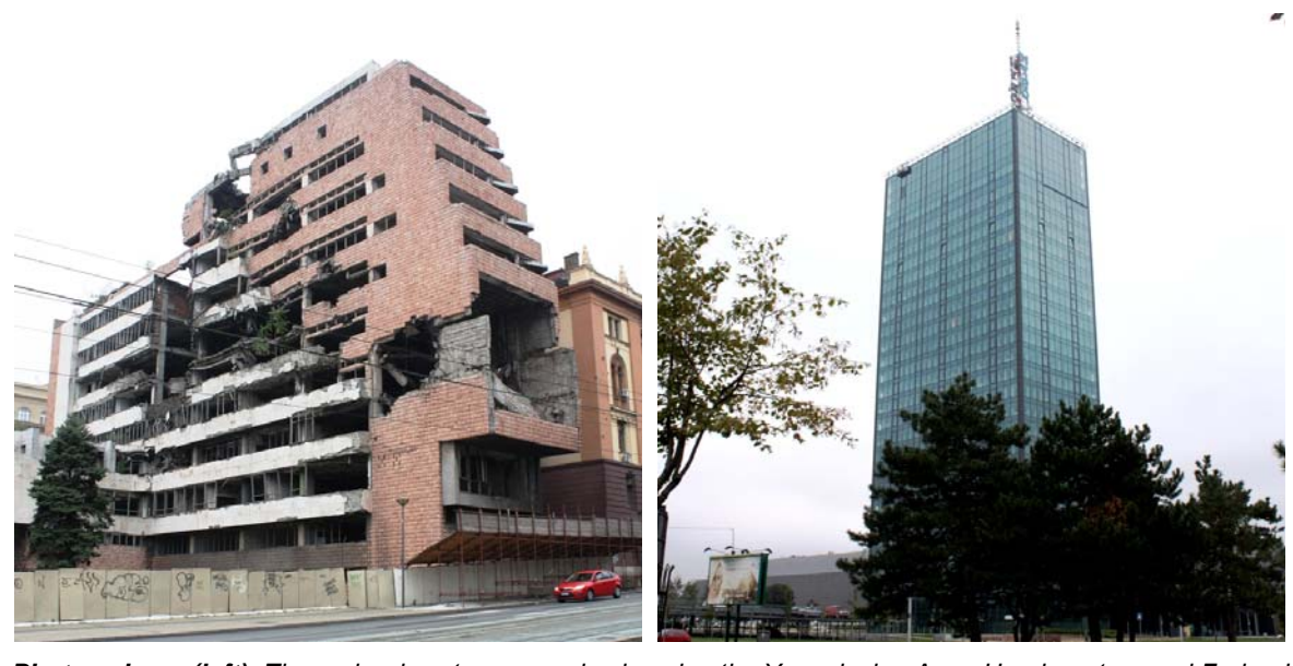
Photos above (left): The major downtown complex housing the Yugoslavian Army Headquarters and Federal Police was heavily bombed in late April 1999; (right) The Ušće Tower in Novi Beograd was by a total of 12 Tomahawk cruise missiles but never collapsed. Built in 1964 as one of the tallest buildings in the Balkans, at the time of the NATO bombing it housed many radio and TV stations and the headquarters of the Central Committee of the League of Communists in the former Yugoslavia. Amazingly enough, the tower was fully repaired in 2003 and today serves as a modern business center.

NATO's bombing campaign involved over a thousand aircraft from various NATO countries operating from air bases throughout the operational theatre, including Italy, Germany, and aircraft carrier in the Mediterranean. A large number of cruise missiles and other long-range munitions were launched from outside the borders of Serbia and Montenegro. The campaign was initially designed to destroy Yugoslavian air defenses and high-value military targets, but when the military operations were not as successful as anticipated, the U.S. led the NATO alliance to broaden the targets to include civilian infrastructure, dual-use communications centers, bridges, power stations, factories, sewage treatment facilities, media outlets and transportation networks, resulting in accusations that NATO was violating the Geneva Conventions.