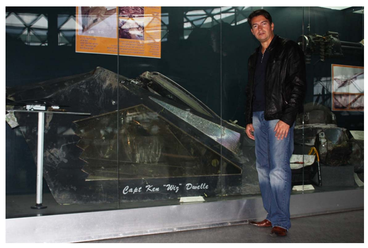
Photo above: The cockpit canopy, pilot's seat, helmet and accessories of the stealthy U.S. F-117A Nighthawk aircraft shot down over Serbia on March 27, 1999. These parts, along with a large section of the plane's left wing, are on display at the Serbian Aviation Museum.