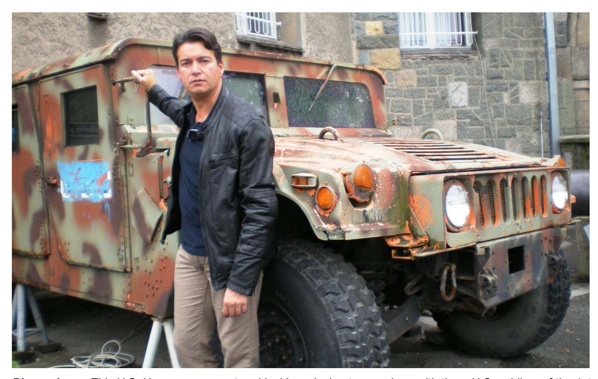
Photo above: This U.S. Humvee was captured by Yugoslavian troops along with three U.S. soldiers of the 1st Infantry Division who were patrolling the Yugoslav-Macedonia border during the NATO airstrikes. The men were released a month later with the help of Rev. Jesse Jackson. The vehicle and personal equipment of the U.S. servicemen are on display at the Military Museum in the Kalemegdan citadel in Belgrade.