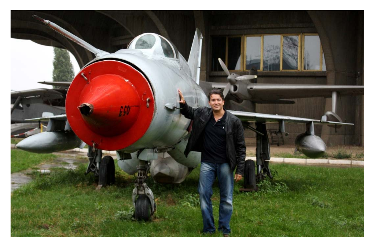
Photo above: A Yugoslavian Air Force MiG-21 in service at the time of the NATO bombing. Many aircraft used during the Cold War are on display at the Aviation Museum adjacent to Belgrade's international airport.

A sizable NATO-led land force had also mobilized in Bosnia, Macedonia and Albania, in preparation for a possible full or partial invasion of Serbia. However, few policymakers in Western governments contemplated such a move, given the high casualties on both sides that would have resulted from a land campaign, in part because of the difficult terrain, an abundance of inhabited towns and villages, and Serbia's potent land-based defenses and camouflage.