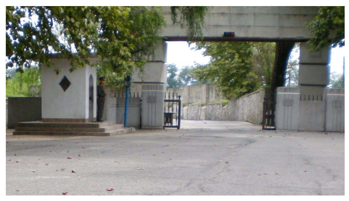
Photo above: A North Korean soldier guards the fortified entrance to the Joint Security Area (JSA). The road leading into the JSA is filled with anti-tank obstacles and is surrounded by minefields and electric fences.

Frieden visited the JSA, which is located in the former farming village of Panmunjom and is the only portion of the DMZ where the armed forces from North Korea and those of the U.S. and South Korea face each other at close range. The area is used by the two Koreas for diplomatic engagements and, until March 1991, was also the site of military negotiations between North Korea and the United Nations Command (UNC). The site features opposing observation posts, many of them equipped with signals intelligence devices and cameras, and three blue conference shacks that straddled the demarcation line.