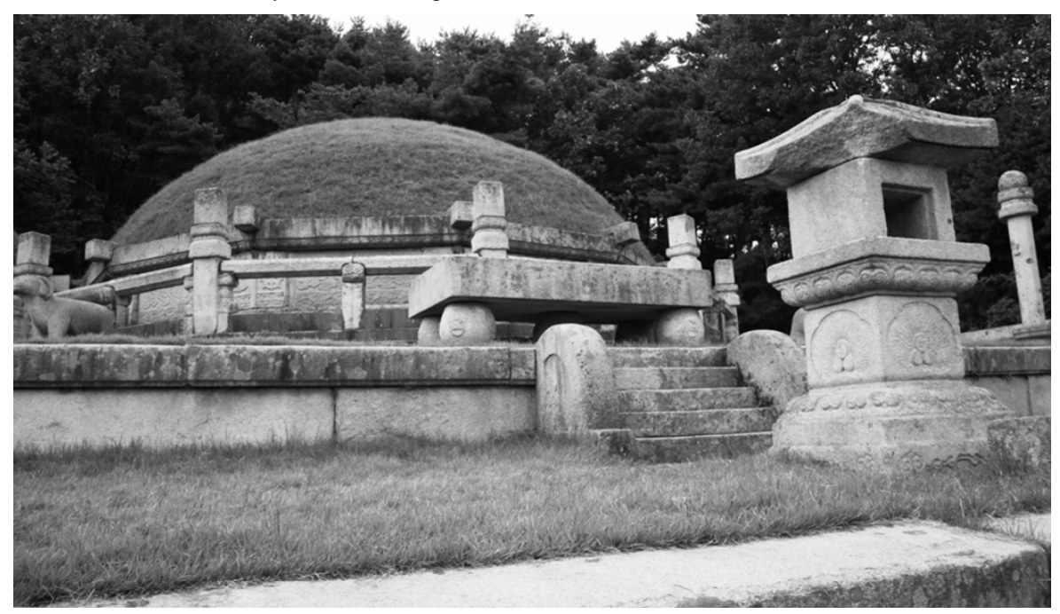
Photo above: Located near Kaesong are tombs and other relics of the Koryo Dynasty that may soon become a UNESCO World Heritage Site, though questions remain as to the authenticity of some of the site's ruins.

Most of Kaesong, like many towns in the DPRK, lies in near-complete darkness at night. Hot water is a rare luxury (not even available at the tourist-friendly Folk Hotel). Most people travel by bike or walk, and only the main boulevards are well-paved. There are very few traffic lights, and just as few private cars or motorcycles. The town has a multitude of large concrete housing units scattered among older, 1950s dwellings. Gas is rationed, the few food shops in sight have only a small selection of goods, and billboards only have political or patriotic themes. Much of the city is gray, void of the colors and the animation of commercialism. "But even in this town, with all the hardships that exist, you'll find locals smiling, even waving back at you," Frieden remarked. "You'll see moments of humanity. You'll see signs of innocence."