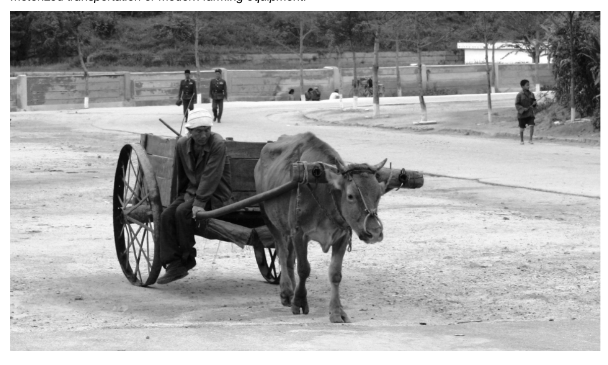
Press Release 090913PR2 -- Author A.C. Frieden Explores the North Korean Side of the DMZ

Photo below: A farmer makes his way through Kaesong. Most North Korean farmers are unable to obtain motorized transportation or modern farming equipment.